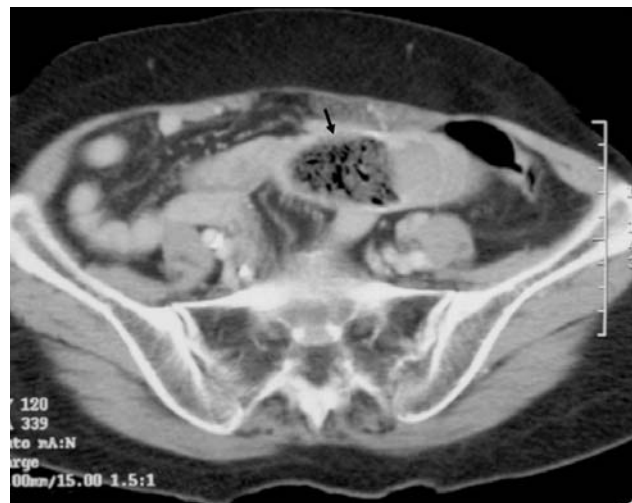
Figure 2 CT scan of the abdomen showing the intraluminal hypodense filling defect with mottled appearance (arrow).

Based on the radiological findings, clinical diagnosis of bezoar causing partial intestinal obstruction was made and an exploratory laparotomy with jejunotomy was performed on the second day of admission. The operation confirmed the clinical suspicion of a bezoar measuring 5 x 3 cm which was found at a distance of 34 cm from the duodeno-jejunal flexure (Figure 3). The jejunum was dilated and hypertrophied but there was no jejunal mass or polyps found. Incidental finding of left clear looking para-ovarian cyst measuring 4 x 4 cm led to left salpingo-oophorectomy at the same time.