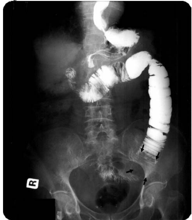
Figure 1 Barium study showing the filling defect in the jejunum with claw-like appearance suspicious of intussusception. The bowel loop distal to the filling defect is collapsed (arrow).

characteristic CT findings immediately alerted us to the diagnosis of a bezoar.